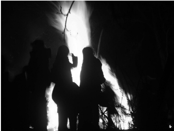
17 February bonfire in Torre Pellice.

about what 'liberty' meant to them. It was also lovely to observe several women dressed in traditional Waldensian costume, with long skirts, scarves and bonnets. Possibly the highlight of the whole occasion was the community meal after the service. This was quite a marathon, with at least five courses, each delicious!